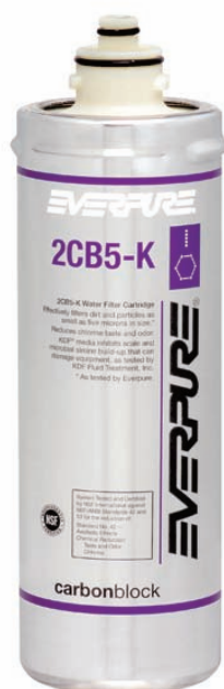
2CB5-K Replacement Cartridge: EV9617-06

Delivers quality water for foodservice, vending and OCS applications