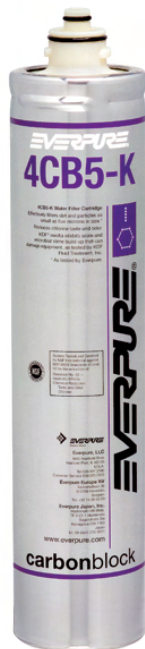
4CB5-K Replacement Cartridge: EV9617-36

Delivers quality water for foodservice, vending and OCS applications